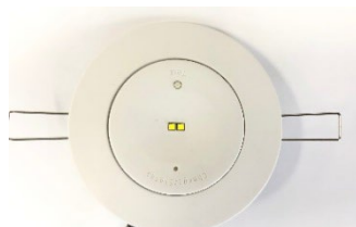
LED Head with Adapter Ring