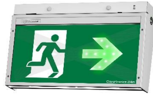
Dynamic LEDs Sequencing Arrow