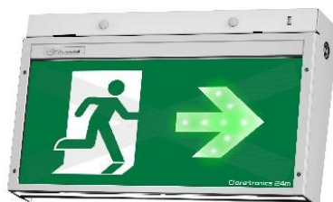
Dynamic LEDs Sequencing Arrow