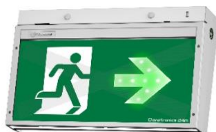
Dynamic LEDs Sequencing Arrow