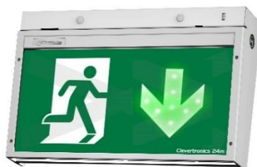
Dynamic LEDs Sequencing Arrow