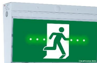
Dynamic LEDs Sequencing Inwards