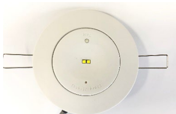
LED Head with Adapter